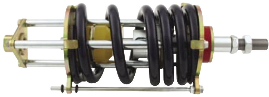
Shown Assembled With Spring - Spring Not Included

Allstar Performance 8300 Lane Dr., Watervliet, MI 49098 Phone: (269) 463-8000 Fax: (800) 772-2618 www.allstarperformance.com